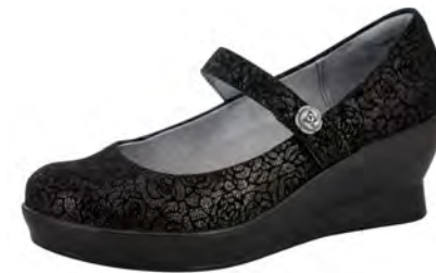
PEWTER FLORETTE | FLA-553