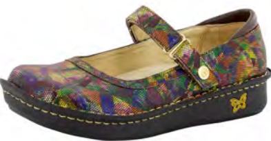
GEO DREAM | BEL-181