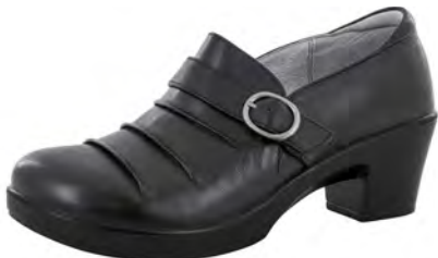
BLACK NAPPA | HAL-601