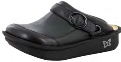
BLACK NAPPA | SEV-601