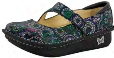
SPIRO BLUE | DAY-327