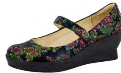
WINTER GARDEN | FLA-315