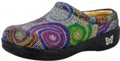
BULLSEYE | KAY-387