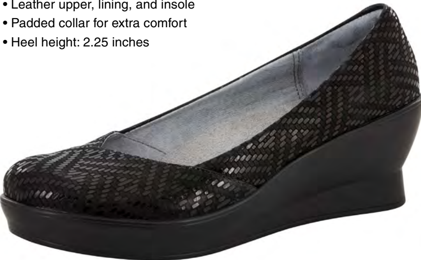
BLACK DAZZLER | FLI-530