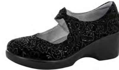
BLACK SPRIGS | ELL-551