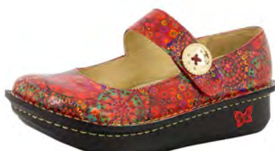
RED BLOOM | PAL-393