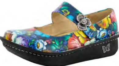
RENAISSANCE | PAL-337