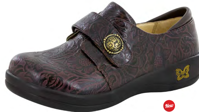
MOLASSES TOOLED | JOL-422