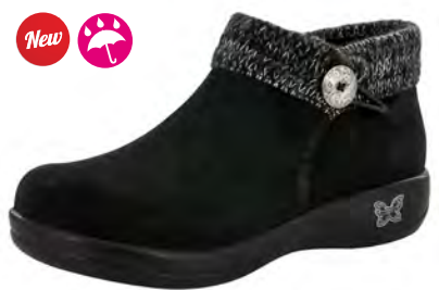
BLACK SILVER | SIT-901