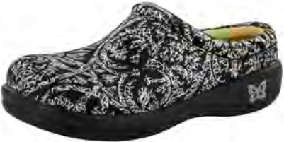
MEDIEVAL | KAY-223