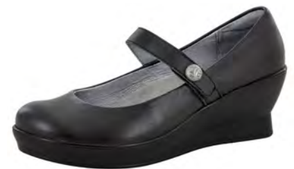
BLACK NAPPA | FLA-601