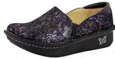
TOTALLY CELLULAR | DEB-538