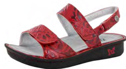
YEEHAW RED | VER-694