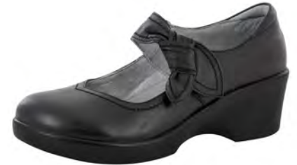
BLACK NAPPA | ELL-601