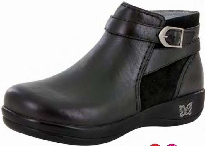
BLACK NAPPA | DYL-601