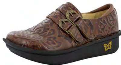
YEEHAW BROWN | ALL-574