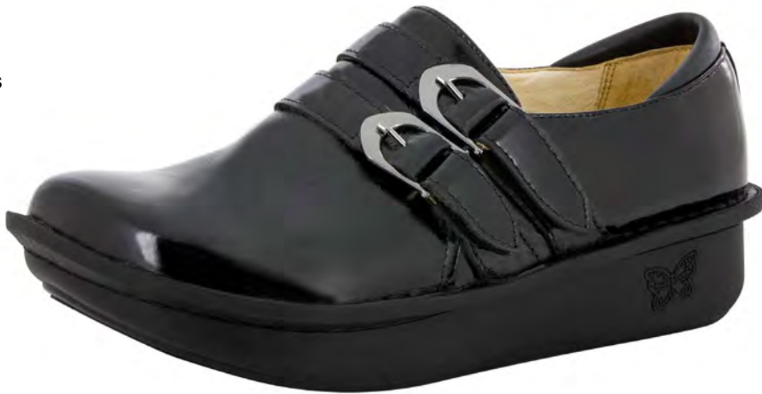
BLACK WAXY | ALL-011