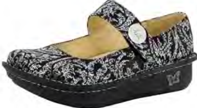
MEDIEVAL | PAL-223