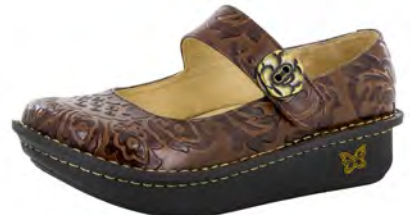
YEEHAW BROWN | PAL-574