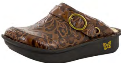
YEEHAW BROWN | SEV-574