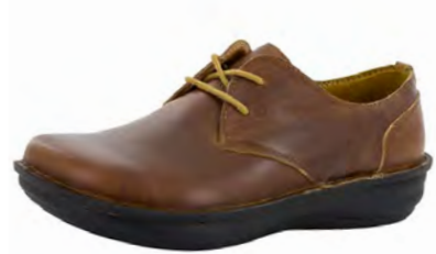
TAWNY | LIA-160