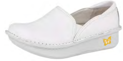
WHITE NAPPA | DEB-600