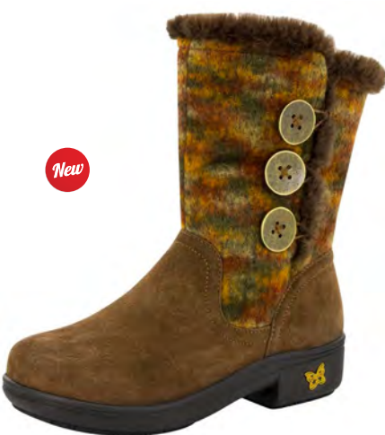
PECAN FUZZY | NAN-902