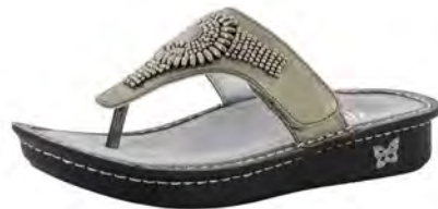
PEWTER HAND CRAFT | VAN-203