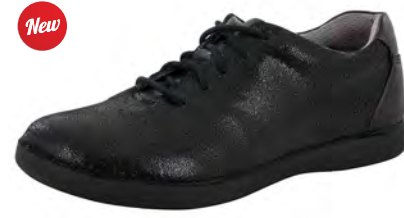
LICORICE SOFT SERVE | ESS-921