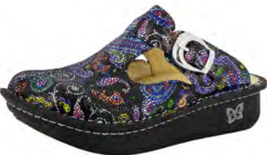
SURREALLY PRETTY | ALG-542