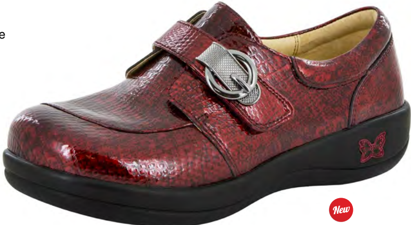
GARNET SNAKE | KHL-164