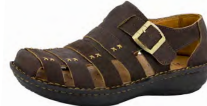
CAFE NUBUCK | MAR-202