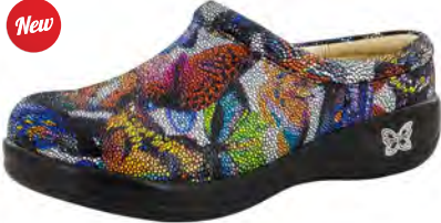
MONARCH | KAY-389