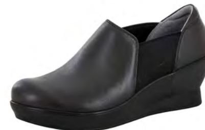
BLACK NAPPA | FRA-601