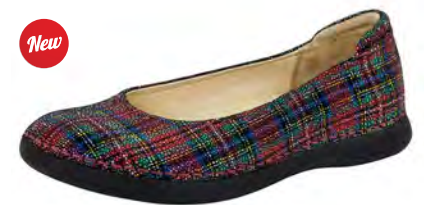
TARTAN | PET-821