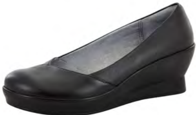
BLACK NAPPA | FLI-601