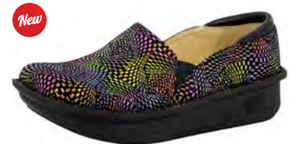
VIEWMASTER | DEB-777