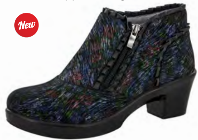
RAKED GARDEN | HAN-316