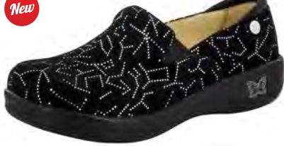
GALILEO | KEL-929