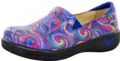
SWIRLY GOODNESS | KEL-686