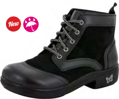
BLACK | IZZ-601