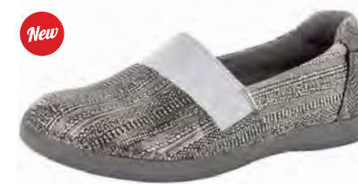
CHAIN MAIL | GLE-713