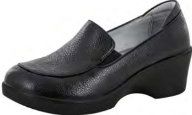
MASONRY BLACK | EMM-801