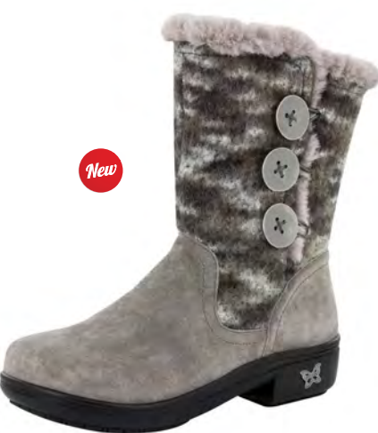
FLINT FUZZY | NAN-906