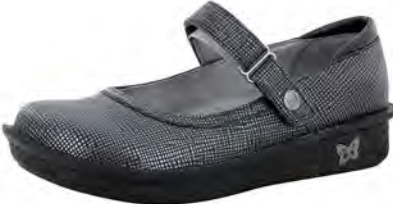
GRID SILVER | BEL-384