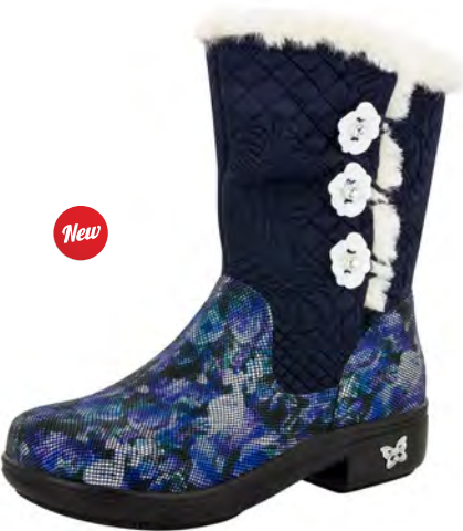
WINTER GARDEN NAVY | NAN-314