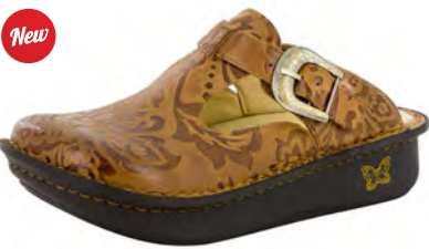
TAN YEEHAW | ALG-575