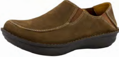
CHOCO NUBUCK | SCH-200