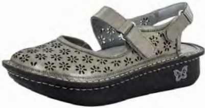
PEWTER EASY | JEM-204