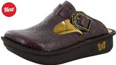
MOLASSES TOOLED | ALG-422