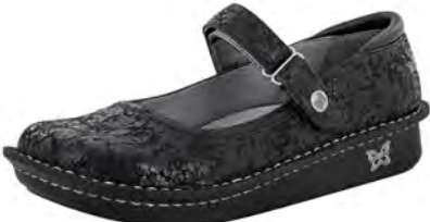
DESERT BLACK | BEL-558