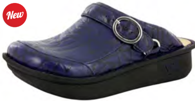
TETRUS BLUE | SEV-627