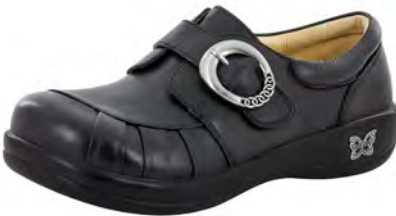
BLACK NAPPA | KHL-601