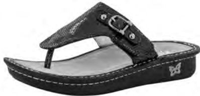
BLACK JEWEL | VAN-441