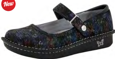
RAKED GARDEN | BEL-316