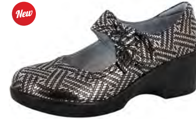
PEWTER DAZZLER | ELL-532