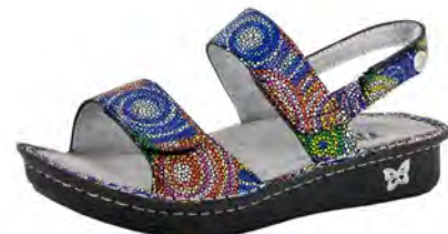
BULLSEYE | VER-387