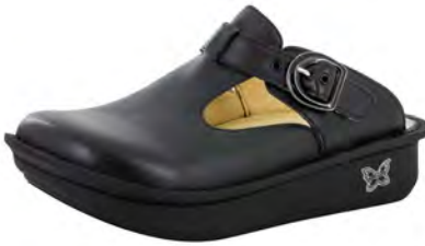
BLACK NAPPA | ALG-601