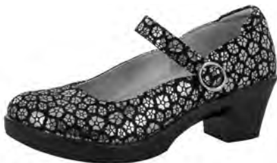
NIGHT POPPY | HAR-485