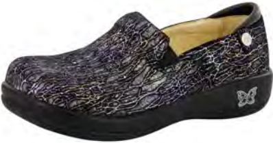
TOTALLY CELLULAR | KEL-538