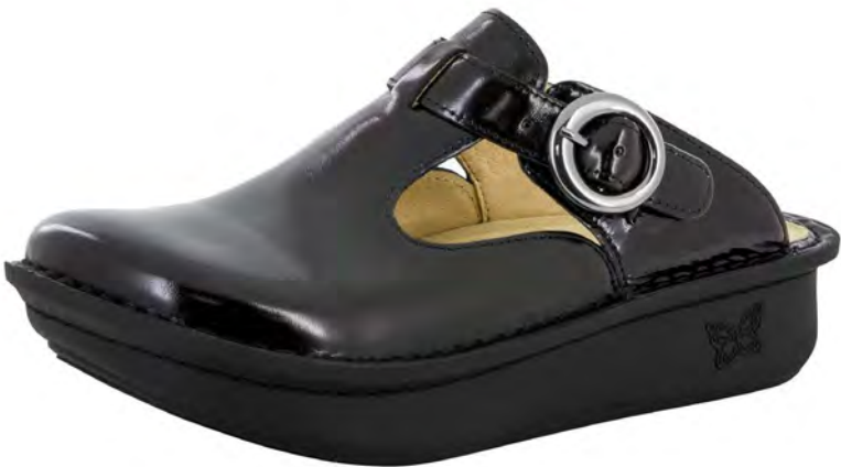
BLACK WAXY | ALG-011