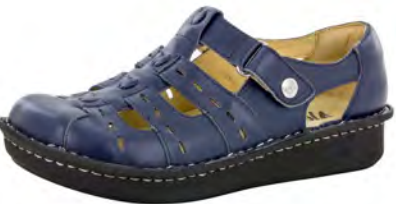
NAVY | PES-622