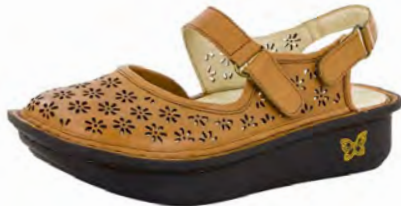
COGNAC BURNISH | JEM-647