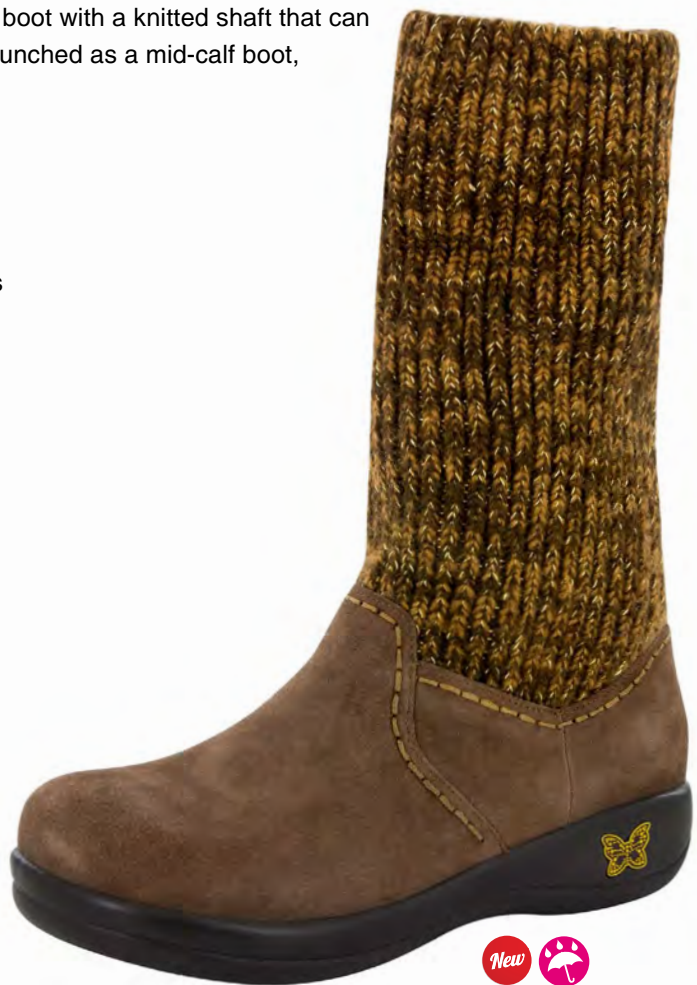
CHOCO GOLD | JUN-902