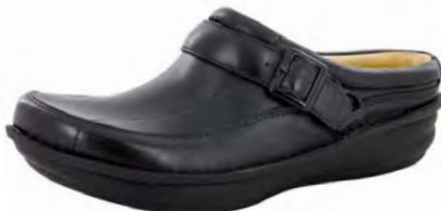
BLACK NAPPA | CHA-100