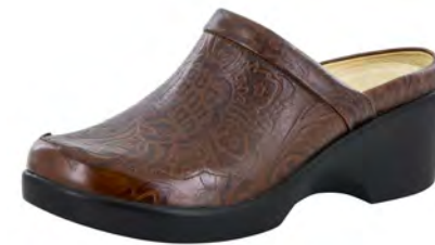
YEEHAW BROWN | ISA-574