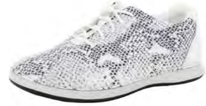
POSH SILVER | ESS-757