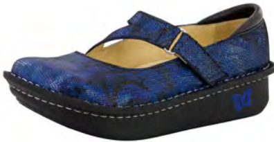
BLACK NAPPA | DAY-741