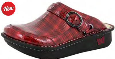
CHERRY CUDE | SEV-144