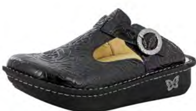
BLACK EMBOSSED ROSE | ALG-531