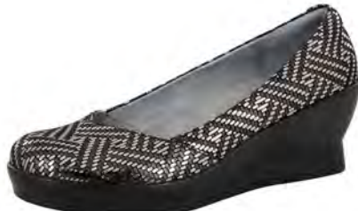
PEWTER DAZZLER | FLI-532