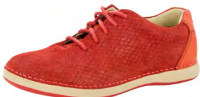
CHERRY | ESS-219