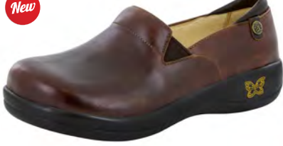
HICKORY | KEL-882