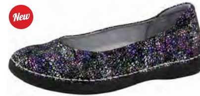
FRACTUALLY | PET-500