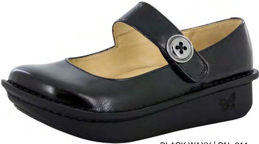
BLACK WAXY | PAL-011