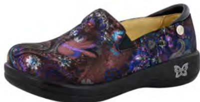
COSMIC | KEL-753