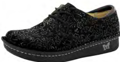
BLACK SPRIGS | BRE-551