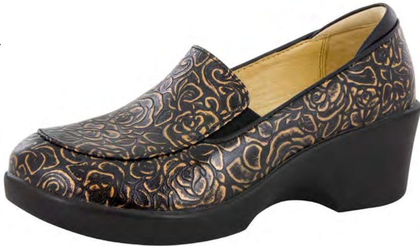
BRONZE BOUQUET | EMM-548