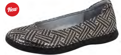
PEWTER DAZZLER | PET-532