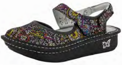
SPIRO MULTI | JEM-325