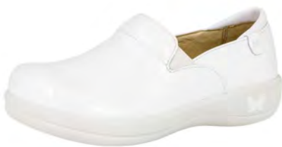
WHITE WAXY | KEL-610