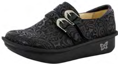
BLACK EMOSSD PAISLEY | ALL-431