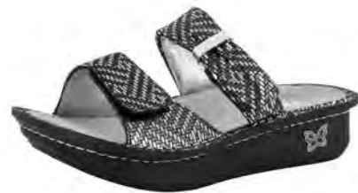
PEWTER DAZZLER | KAR-532