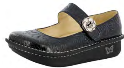
BLACK EMBOSSED ROSE | PAL-531