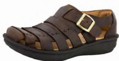
GRAVY | MAR-602