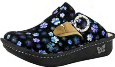
LUCK BE A LADY | ALG-555