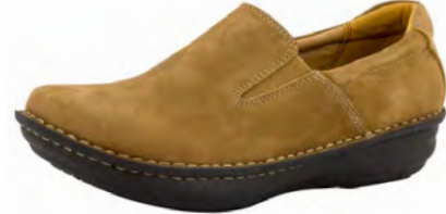
CAFE | OZ-212