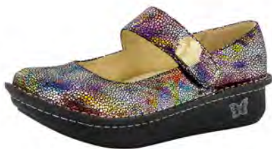
TOTS GORGE | PAL-330