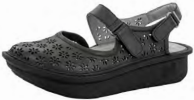
BLACK BURNISH | JEM-711