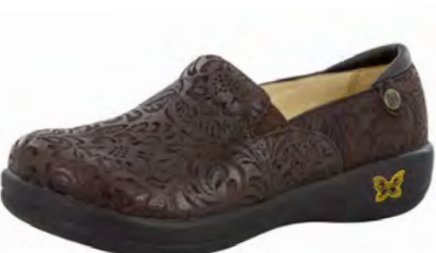
CHOCO EMBOSSED PAISLEY | KEL-433