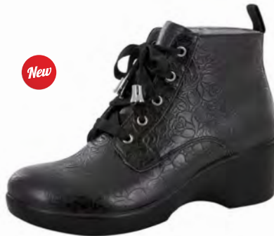
BLACK BLOOM | ELI-552