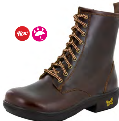
HICKORY | ARI-882