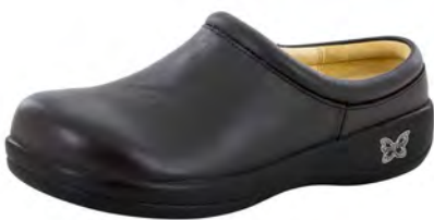
BLACK NAPPA | KAY-601