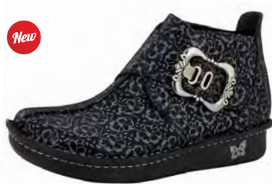
FLORA | CAT-917