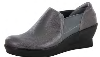
GREY GLAZE | FRA-883