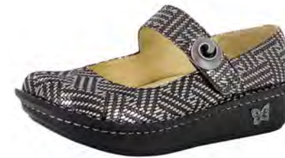
PEWTER DAZZLER | PAL-532