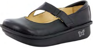
BLACK NAPPA | DAY-601