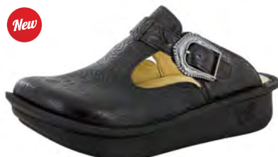
TAR TOOLED | ALG-429