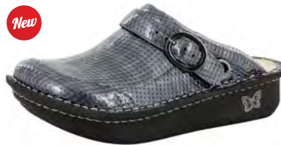
CHROME CUBE | SEV-143