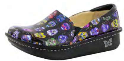
SUGAR SKULLS | DEB-484