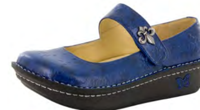
NAVY FLEUR | PAL-536