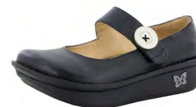
BLACK NAPPA | PAL-601