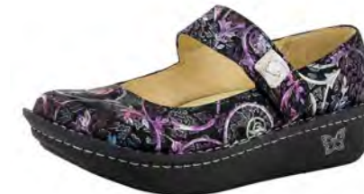
LOVELY | PAL-539