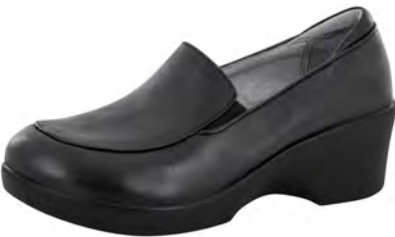
BLACK NAPPA | EMM-601