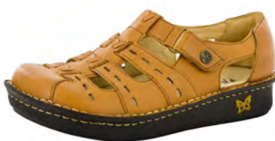
TAWNY | PES-647