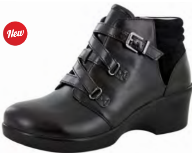
BLACK | IND-601