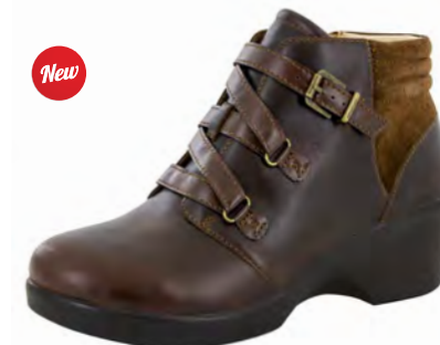
HICKORY | IND-882