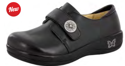
BLACK NAPPA | JOL-601