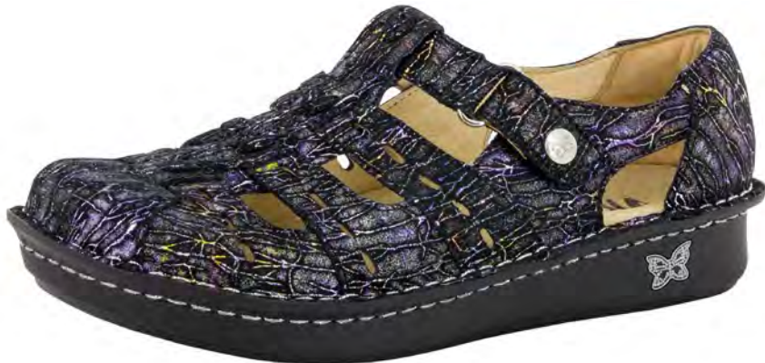
TOTALLY CELLULAR | PES-538