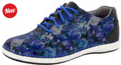
WINTER GARDEN NAVY | ESS-314