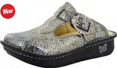
POSH PEWTER | ALG-759