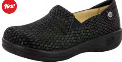
WAVERLY | KEL-752