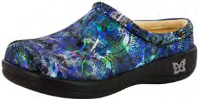
FROND OF YOU | KAY-264