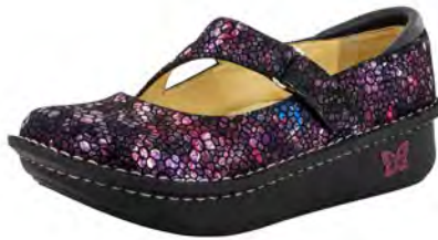
RED METALLIC FUN | DAY-249