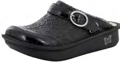
YEEHAW BLACK | SEV-691