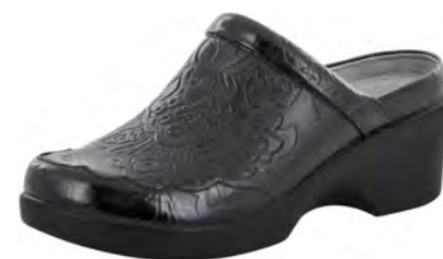
YEEHAW BLACK | ISA-691