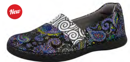
SURREALLY PRETTY | GLE-542