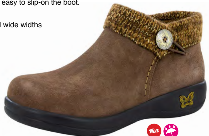
CHOCO GOLD | SIT-902