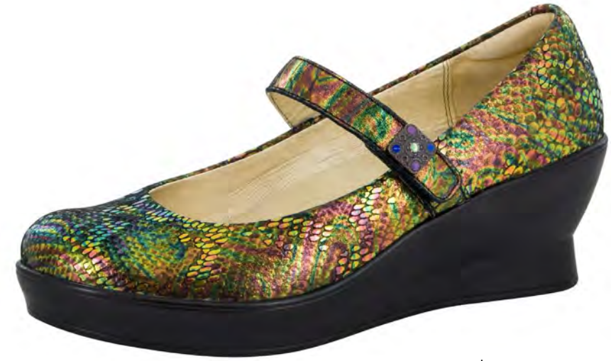
THRONES | FLA-238