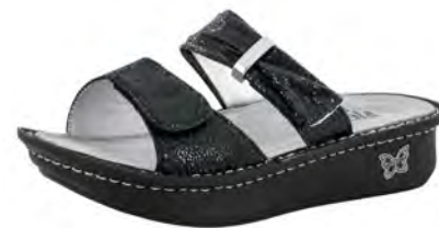
BLACK METALLIC FUN | KAR-237