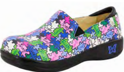
ALL TOGETHER NOW | KEL-302