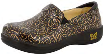
BRONZE BOUQUET | KEL-548