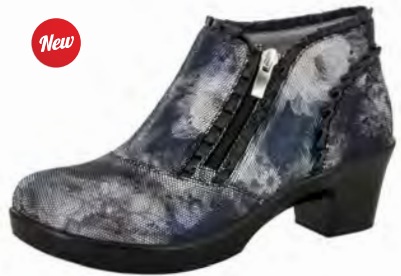
ELEGANCE | HAN-747