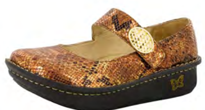
RICHES | PAL-742