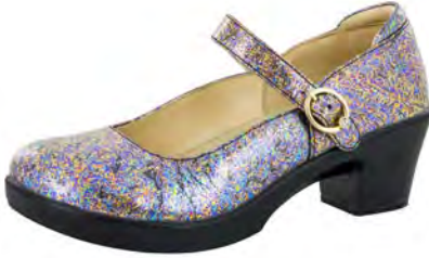
SPECTRUM | HAR-507