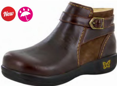
HICKORY | DYL-882