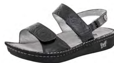
YEEHAW BLACK | VER-691