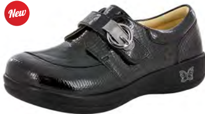
OBSIDIAN SNAKE | KHL-161