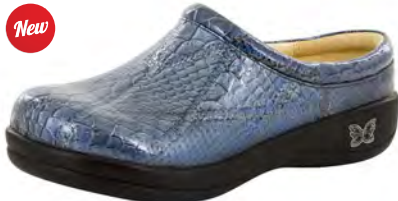
ICEY | KAY-427