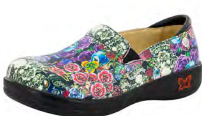
TATOO YOU | KEL-510