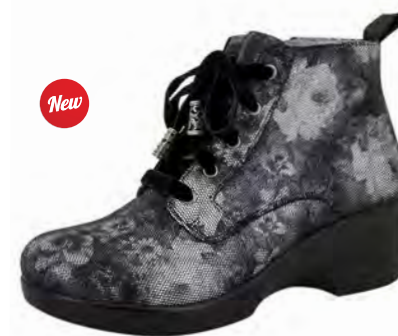
ELEGANCE | ELI-747