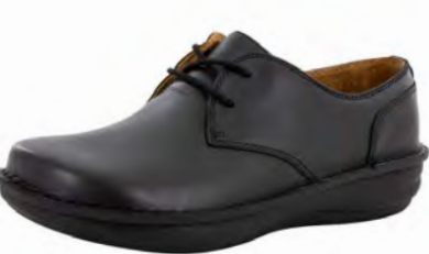
BLACK NAPPA | LIA-100