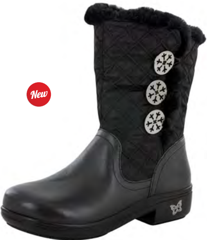
QUILTED BLACK | NAN-601