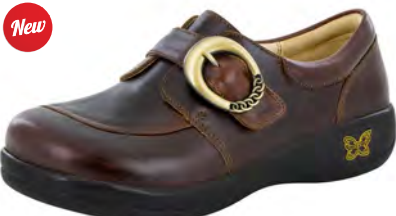
HICKORY | KHL-882