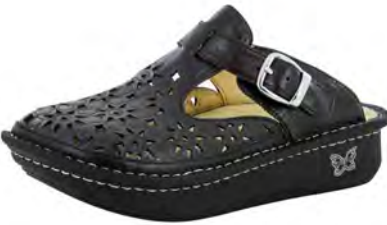
BREEZY DUSTY BLACK | ALG-631