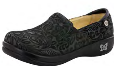
BLACK EMBOSSED PAISLEY | KEL-431