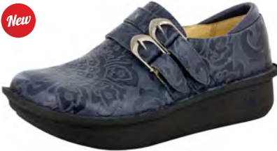
YEEHAW NAVY | ALL-576