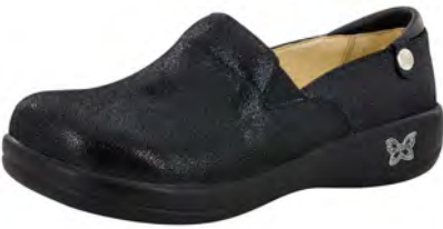
BLACK MOSAIC | KEL-755