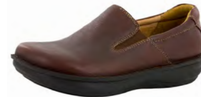
CHOCO WAXED TUMBLED | OZ-145