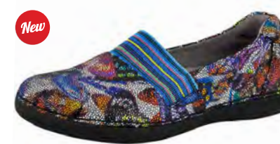
MONARCH | GLE-389