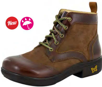
HICKORY | IZZ-882