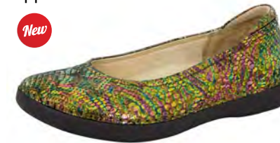
THRONES | PET-238