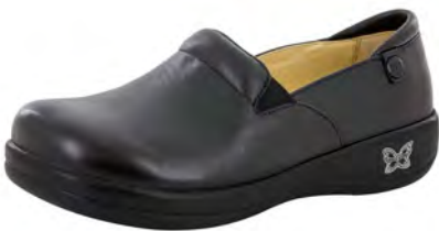
BLACK NAPPA | KEL-601