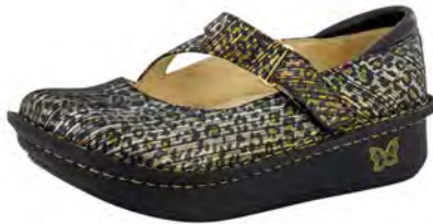
LEOPARD STRIPES | DAY-403