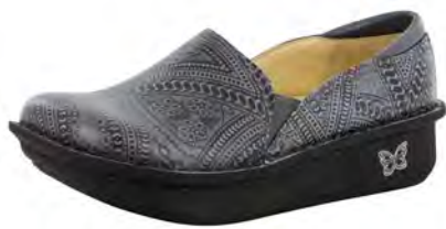
WILD WEST ASH | DEB-345