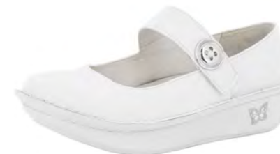
WHITE NAPPA | PAL-600S