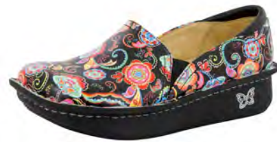
PAISLEY PARTY | DEB-480