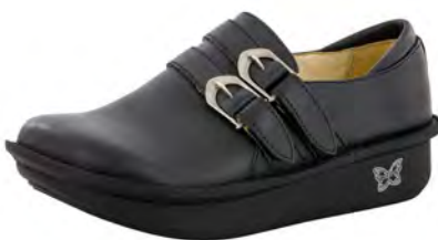
BURNISH BLACK | ALL-611