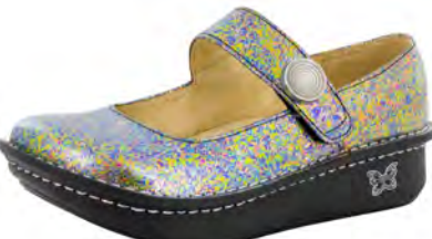
SPECTRUM | PAL-507