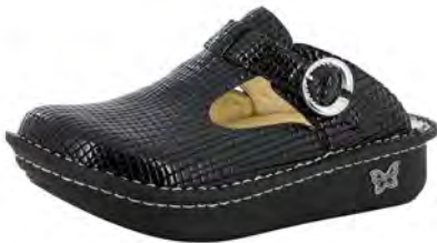
JAZZY BLACK | ALG-231