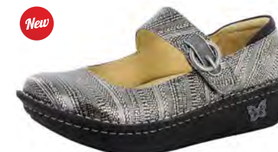
CHAIN MAIL | PAL-713