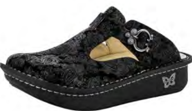
GRACIE | ALG-561