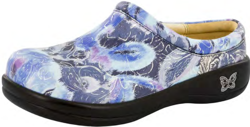
ARTISAN BLUE | KAY-243