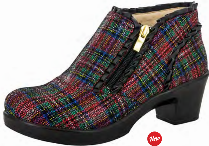
TARTAN | HAN-821