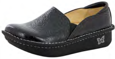
BLACK EMBOSSED ROSE | DEB-531