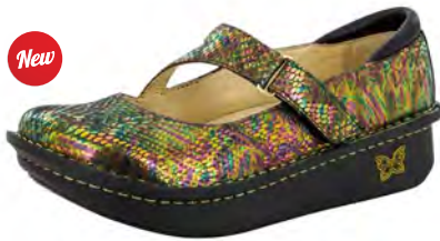
THRONES | DAY-238