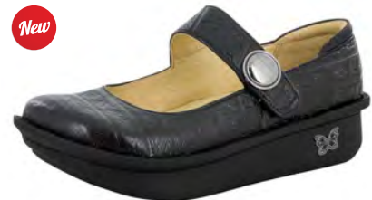
HIEROGLYPH | PAL-661