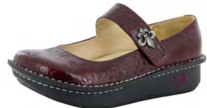
WINE FLEUR | PAL-537