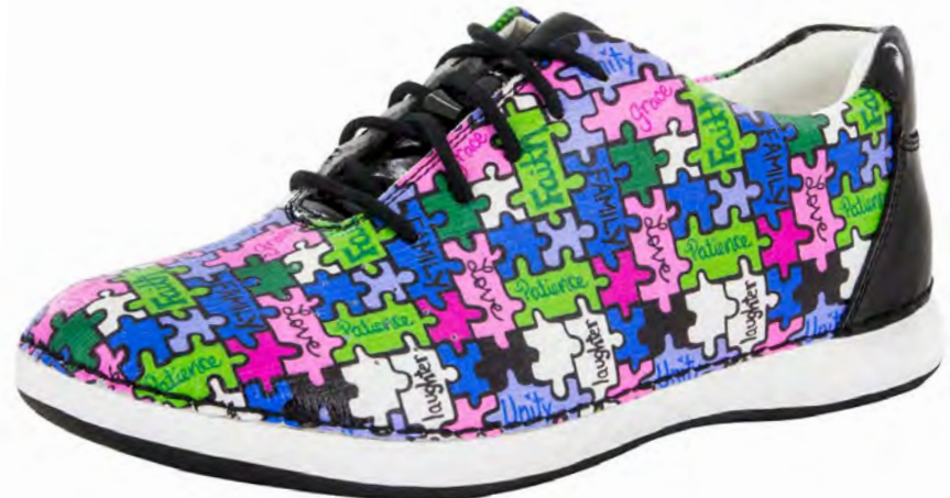
ALL TOGETHER NOW | ESS-302