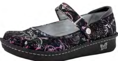
LOVELY | BEL-539