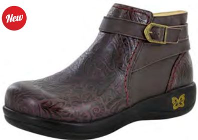
MOLASSES TOOLED | DYL-422