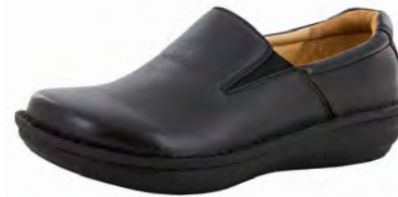
BLACK TUMBLED | OZ-100