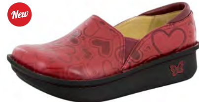
I HEART U RED | DEB-654