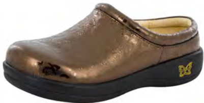
BRONZE VINE | KAY-549