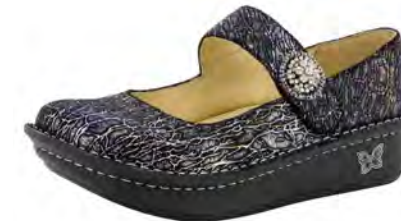
TOTALLY CELLULAR | PAL-538