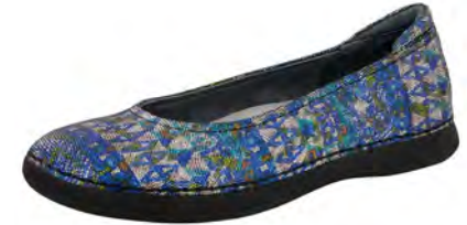
RAVE ON THE NILE | PET-321