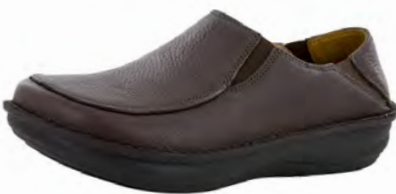
CHOCO | SCH-140