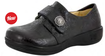
TAR TOOLED | JOL-429