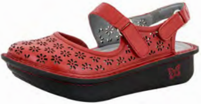
RED BUTTER | JEM-645