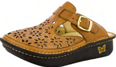
BREEZY DUSTY COGNAC | ALG-637