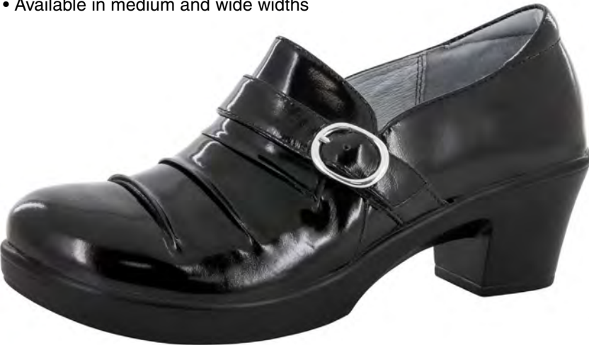
BLACK WAXY | HAL-011