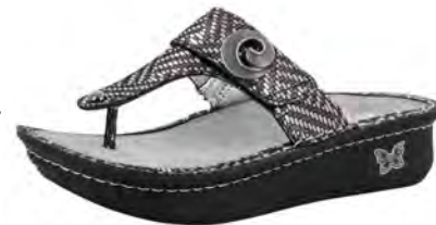
PEWTER DAZZLER | CAR-532