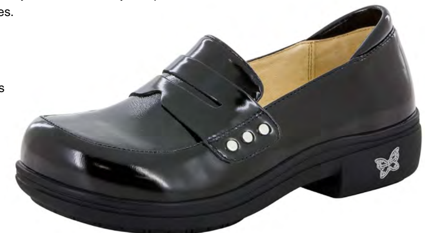
BLACK SHINY | TAY-611