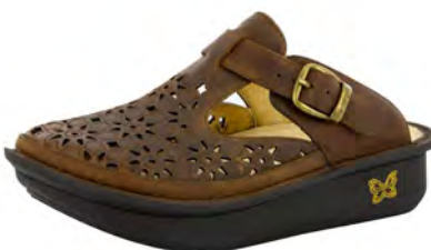
BREEZY TAWNY | ALG-644