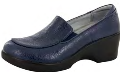
MASONRY BLUE | EMM-803