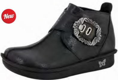
BLACK SWIRL | CAT-521