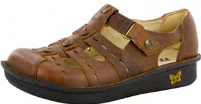
TAWNY | PES-644