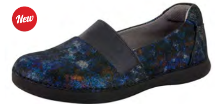
ETHERS | GLE-760