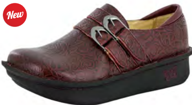
OXBLOOD BLOOM | ALL-554