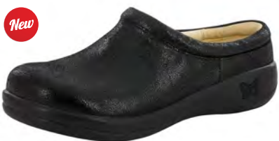
LICORICE SOFT SERVE | KAY-921