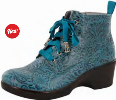
TEAL TOOLED | ELI-425