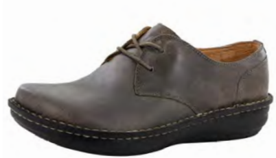
DRIFTED | LIA-170