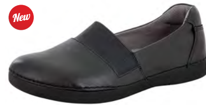
BLACK NAPPA | GLE-601