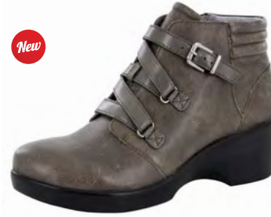
DRIFTED | IND-643