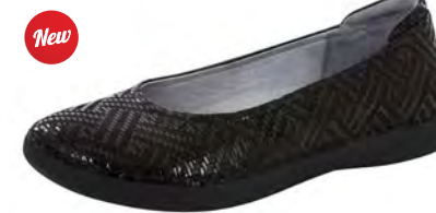
BLACK DAZZLER | PET-530