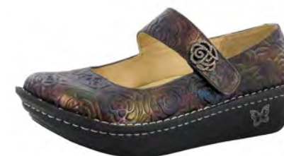
ROSE SHADOW | PAL-683