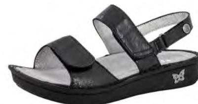
UPTOWN BLACK | VER-211