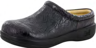
NIGHT ROSETTE | KAY-541