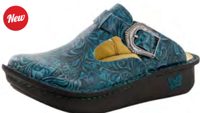
TEAL TOOLED | ALG-425