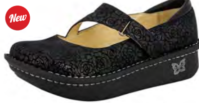
PEWTER FLORETTE | DAY-553