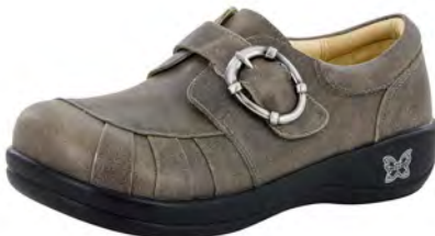
DRIFTED | KHL-643