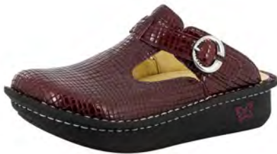
JAZZY WINE | ALG-232