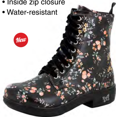
SWEETIE PIE | ARI-346