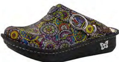
SPIRO MULTI | SEV-325