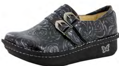
BLACK & SILVER ROSE | ALL-571