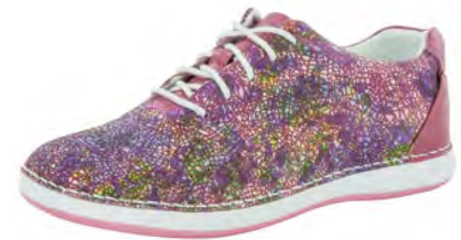
SWEET MELANGE | ESS-488