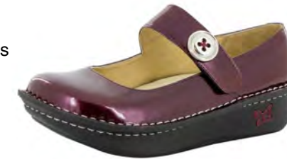
WINE GLITTER PATENT | PAL-528