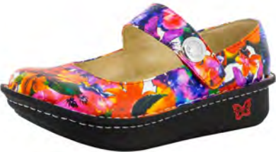
IRIS | PAL-135