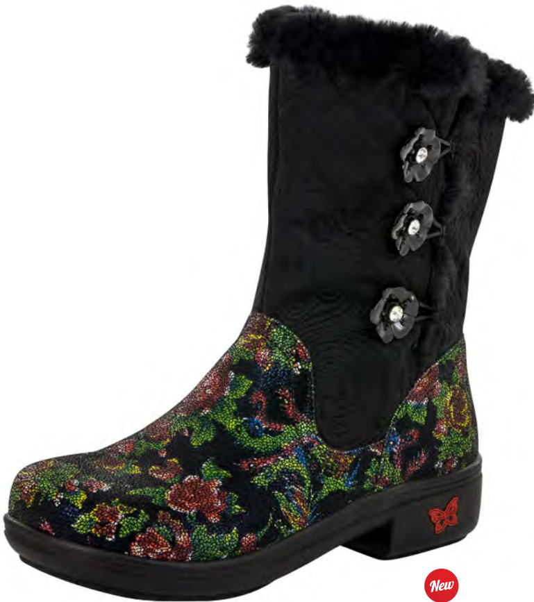
WINTER GARDEN | NAN-315