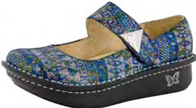
RAVE ON THE NILE | PAL-321