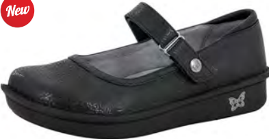
BLACK SWIRL | BEL-521