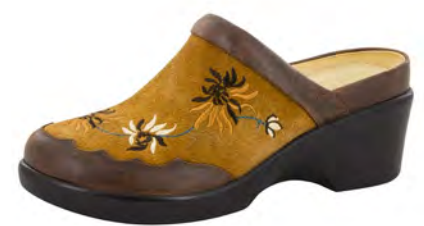
EMBROIDERY TAN | ISA-632