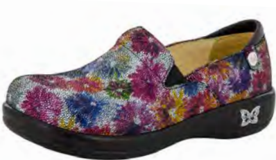
BLOOMIES | KEL-506