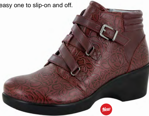
OXBLOOD BLOOM | IND-554