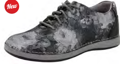
ELEGANCE | ESS-747