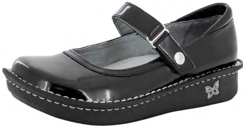
BLACK CRINKLE | BEL-101