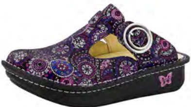
SPIRO PURPLE | ALG-324