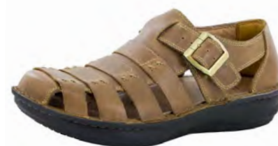
BROWN | MAR-200