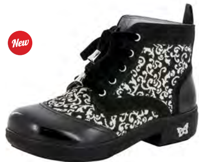
TENDRIL | KYL-651