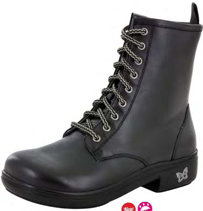
BLACK | ARI-601