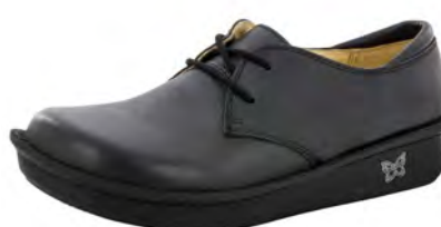
BURNISH BLACK | BRE-611