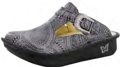
WILD WEST ASH | ALG-345