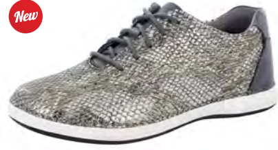
POSH PEWTER | ESS-759