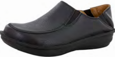
BLACK TUMBLED | SCH-100