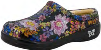
HELLO LOVE | KAY-395