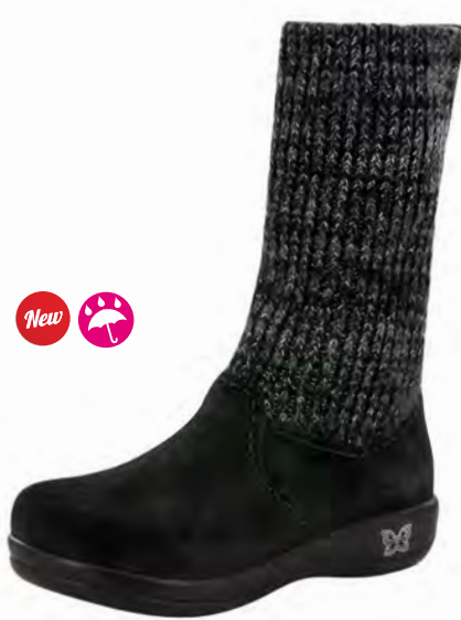
BLACK SILVER | JUN-901