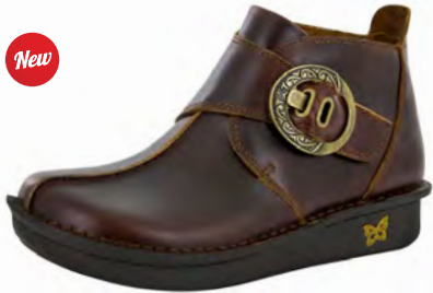
HICKORY | CAT-882