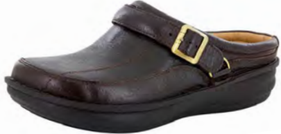
DARK BROWN WAXED TUMBLED | CHA-120