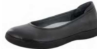
BLACK NAPPA | PET-601