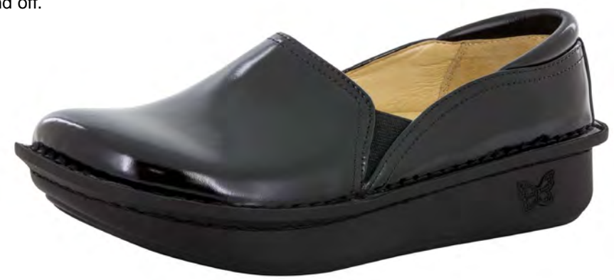
BLACK WAXY | DEB-011