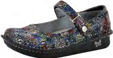
CATHEDRAL | BEL-391