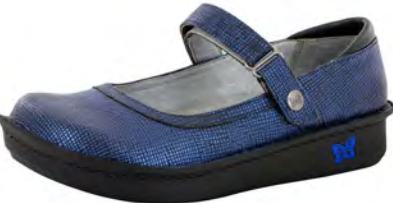
GRID BLUE | BEL-385