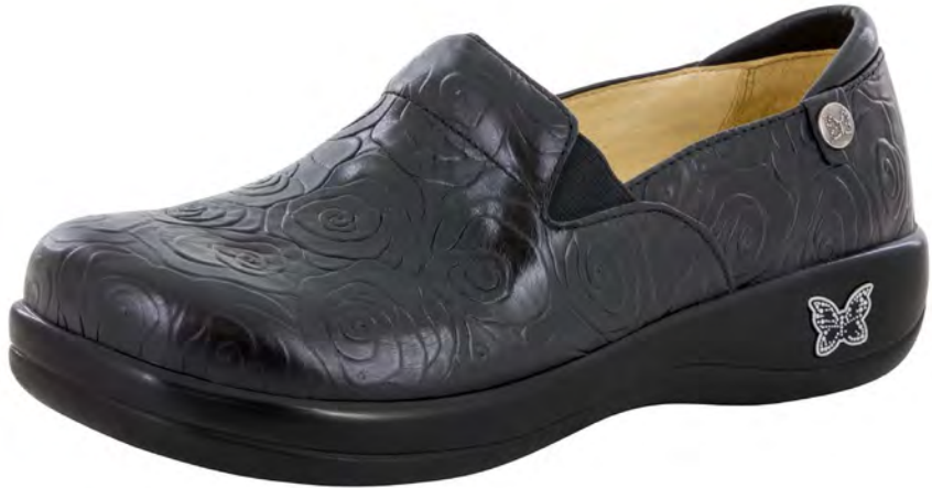
NIGHT ROSETTE | KEL-541