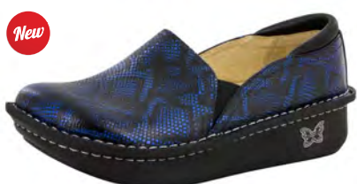
NAVY PYTHON | DEB-783