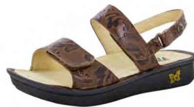
YEEHAW BROWN | VER-574