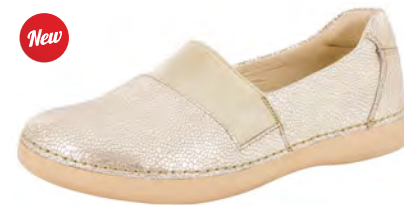
IT'S GLITZ | GLE-236