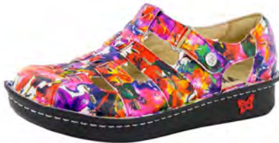
IRIS | PES-135