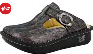
PEWTER THUMBPRINT | ALG-719