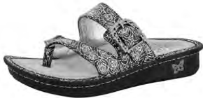
STEEL ROSETTE | VAL-535