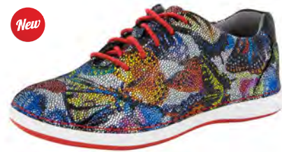
MONARCH | ESS-389