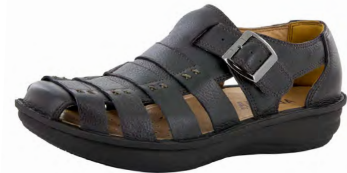
BLACK TUMBLED | MAR-100