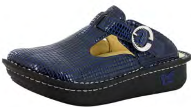
JAZZY BLUE | ALG-233