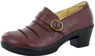
CARMENERE | HAL-605