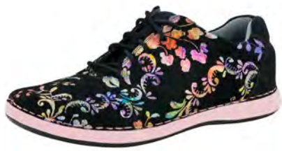
REGAL BEAUTY | ESS-557