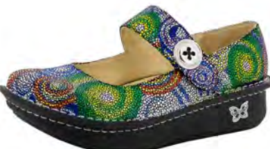
BULLSEYE | PAL-387