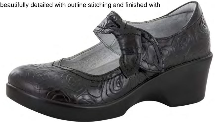
NIGHT ROSETTE | ELL-541