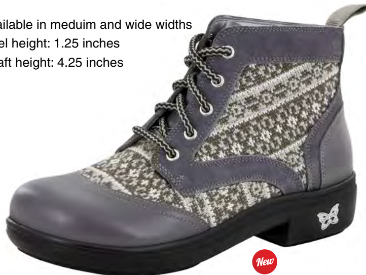
SNUGGY GREY | KYL-653