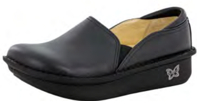
BLACK NAPPA | DEB-601