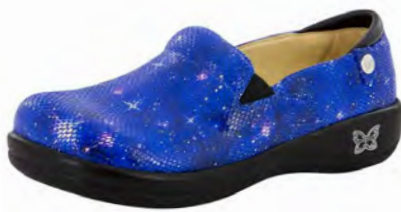
INTERGALACTIC | KEL-245