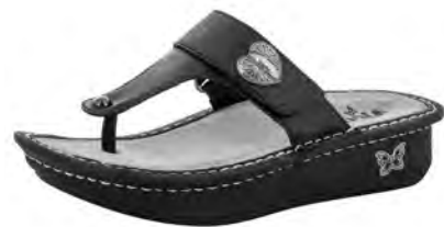
BLACK NAPPA | CAR-601